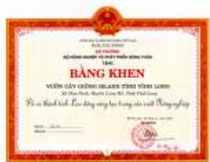
Certificate of Ministry of Agriculture and Ministry of Trade

- All products, manufactured by IFC Corp., are checked qualitative consistent with Sector Standards or Enterprises Standard.