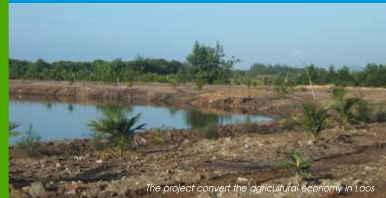
The project convert the agricultural economy in Laos

The leading supplier of fruit tree in Vietnam