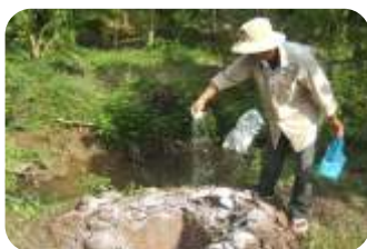
Delivery of goods & planting service